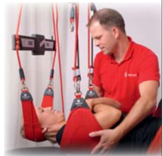
Redcord Workstation med Redcord Stimula.

www.redcord.no redcord@redcord.com tlf. 37 05 97 70