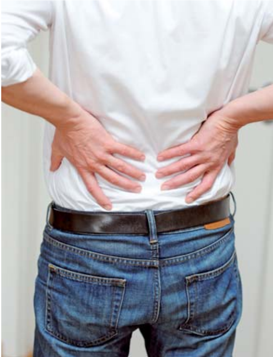
KORSRYGSMERTER Fear-avoidance beliefs (FAB) er overdreven frykt for bevegelser. Dette kan føre til at man unngår bevegelser og aktiviteter, og dermed bidrar til å opprettholde ryggplagene.

Many patients have more fear about their back pain than necessary.