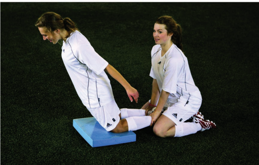
Fig 1 | Two examples of strength exercises. Top: side plank exercise. Bottom: the "Nordic hamstring lower"

Monica Orthopaedic and Sports Medicine Research Foundation, and the FIFA Medical Assessment and Research Centre, developed the warm-up programme. Before the start of the study one club tested the programme. It consisted of three parts (table 1). The initial part was running exercises at slow speed combined with active stretching and controlled contacts with a partner. The running course included six to ten pairs of cones (depending on the number of players) about five to six metres apart (length and width). The second part consisted of six different sets of exercises; these included strength (fig 1), balance, and jumping exercises, each with three levels of increasing difficulty. The final part was speed running combined with football specific movements with sudden changes in direction.