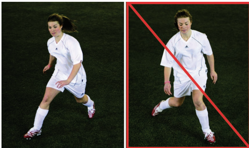
Fig 2 | Example of running exercise illustrating key objectives of all running, jumping, cutting, and landing exercises: core stability and correct lower extremity alignment. Left: correct technique; right: incorrect technique with pelvic tilt and knee valgus alignment to right

per club and a dropout rate of 15%, which means that we needed to include about 120 clubs with 2150 players.